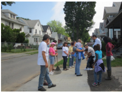
Praying on our adopted street

The Summer weather was suitable to be active and on the go. During the summer Heart & Soul was very active with different ministry opportunities. The Youth Ministry celebrated various activities such as a lock-in, pool party, and a camping trip. Through Adopt a Block we were able to build relationships with many families on the street we Adopted, Burbank St. It has been a special blessing every time we go out and are able to talk and pray with our Block families. We also celebrated baptism at the lake during a wonderful joint service with two sister congregations.